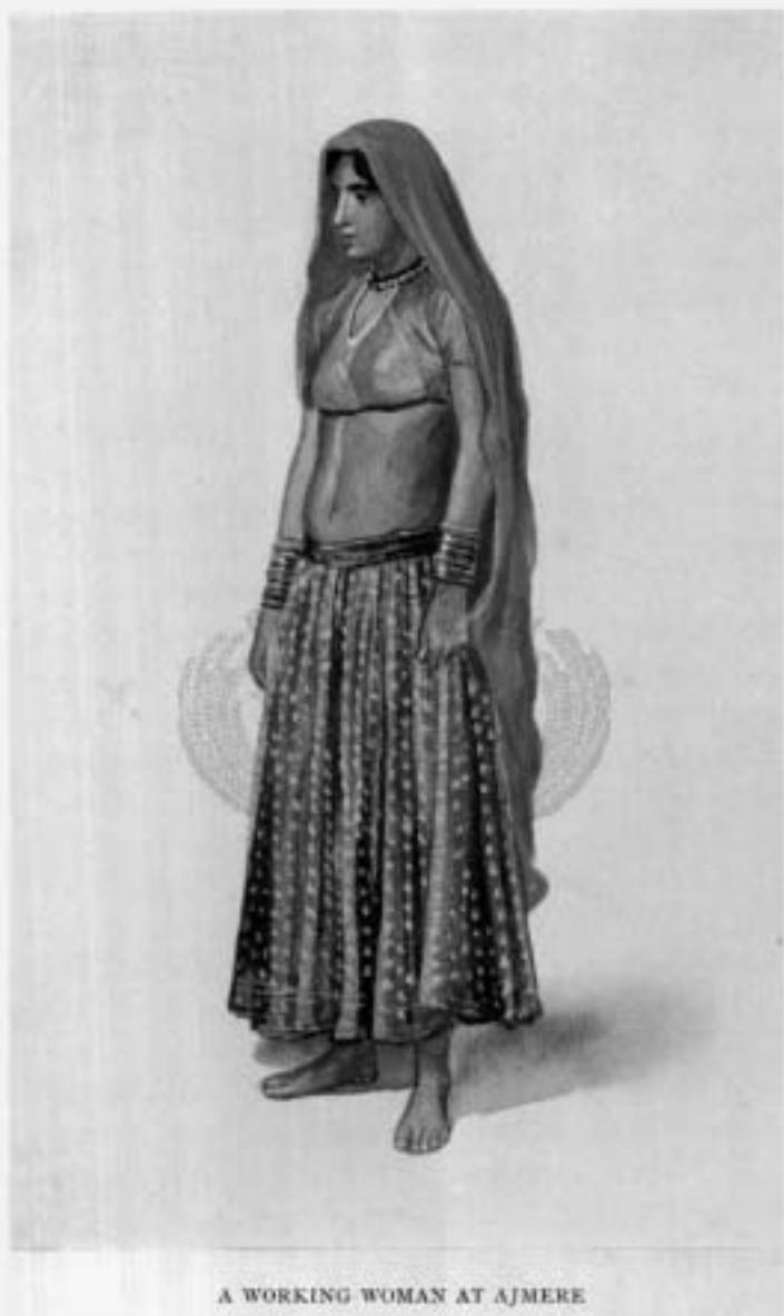
A WORKING WOMAN AT AJMERE